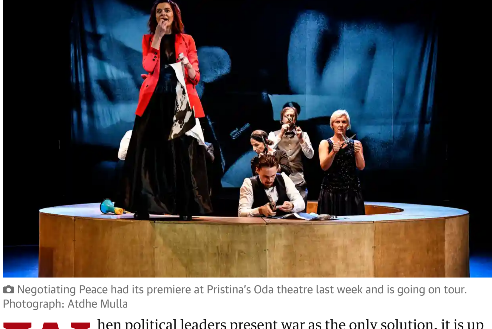
Negotiating Peace had its premiere at Pristina's Oda theatre last week and is going on tour.

When political leaders present war as the only solution, it is up to artists to remind people that finding peace is still possible. That is the starting point for a Kosovo-based theatre company, Qendra Multimedia, whose new play returns to the last war in Europe before Russia's invasion of Ukraine and explores how it was stopped.